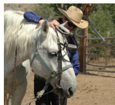
Clicker Training for problem solving-Fast, Calm & Fun ☺