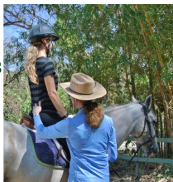
Centered Riding mounted sessions to improve communication, balance & security.