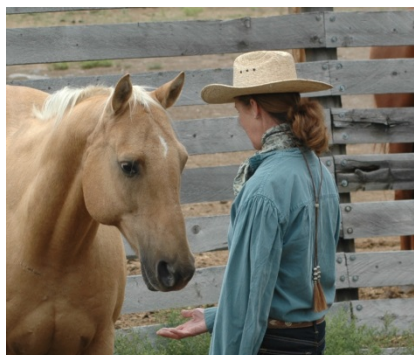
Developing Trust through awareness & mindfulness