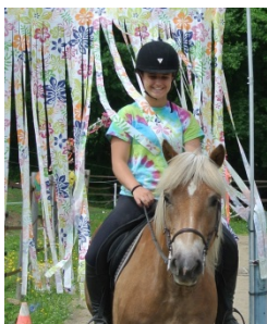
Obstacle play to improve confidence and develop trust.